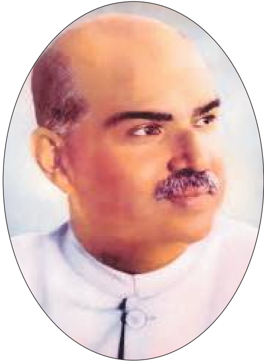
Dr. Syama Prasad Mookerjee