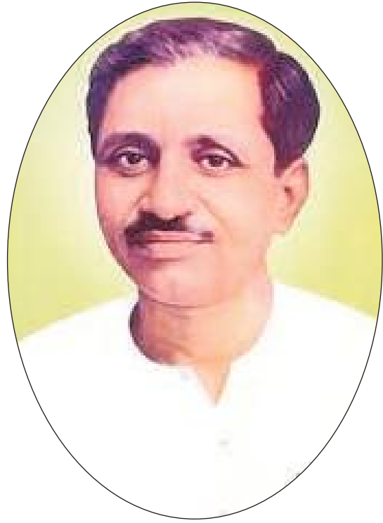
Pt. Deendayal Upadhyaya