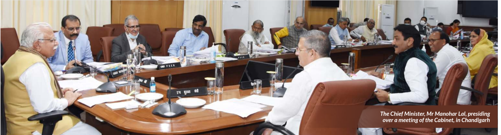
The Chief Minister, Mr Manohar Lal, presiding over a meeting of the Cabinet, in Chandigarh