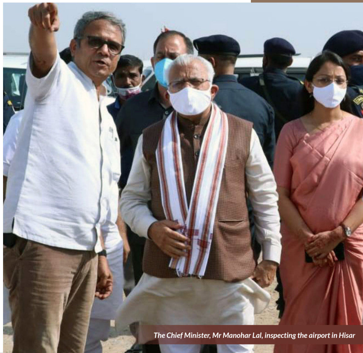
The Chief Minister, Mr Manohar Lal, inspecting the airport in Hisar

A meeting will soon be held with the Himachal Pradesh government to establish this helidrome. Helicopter flights to stations like Shimla, Kullu and Dharamsala can operate from Pinjore.