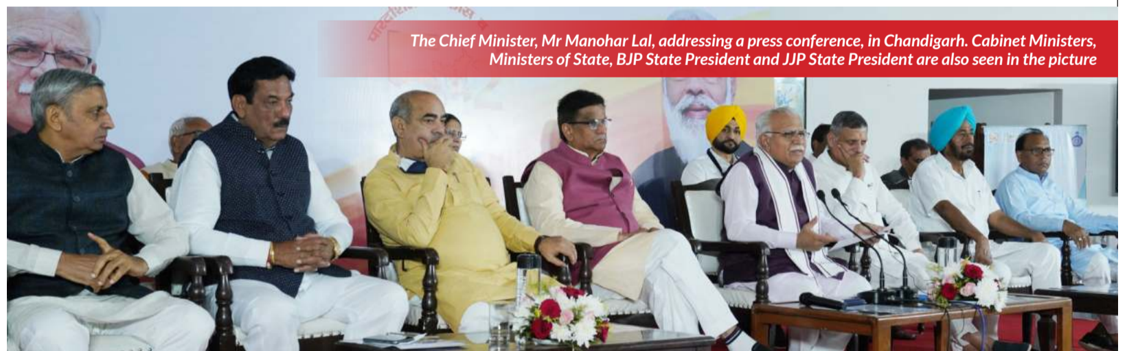
The Chief Minister, Mr Manohar Lal, addressing a press conference, in Chandigarh. Cabinet Ministers, Ministers of State, BJP State President and JJP State President are also seen in the picture

The eligible beneficiaries can visit any nearest Saral Kendra, Antyodaya Kendra or Common Service Center to get the benefits of any welfare scheme.