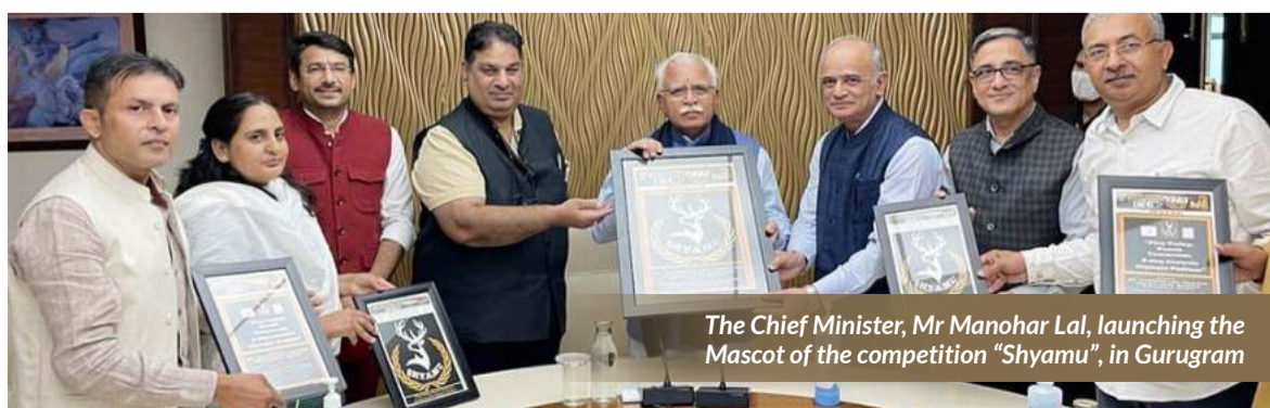
The Chief Minister, Mr Manohar Lal, launching the Mascot of the competition "Shyamu", in Gurugram

Appreciating Mr Manohar Lal's inclination towards fencing, she said he is the first Chief Minister to take interest in traditional sport like fencing.