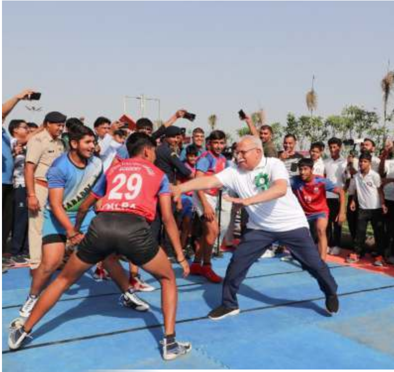
The Chief Minister, Mr Manohar Lal, playing 'Kabaddi' and doing cycling in Gurugram.