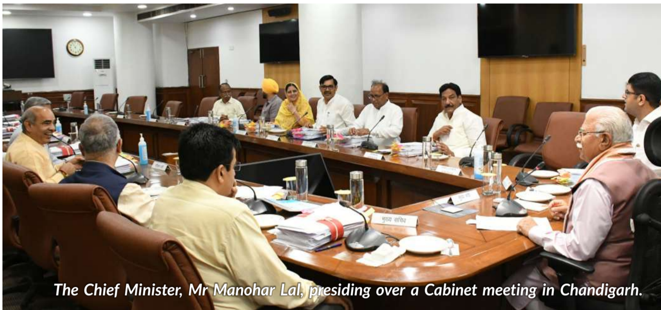
The Chief Minister, Mr Manohar Lal, presiding over a Cabinet meeting in Chandigarh.