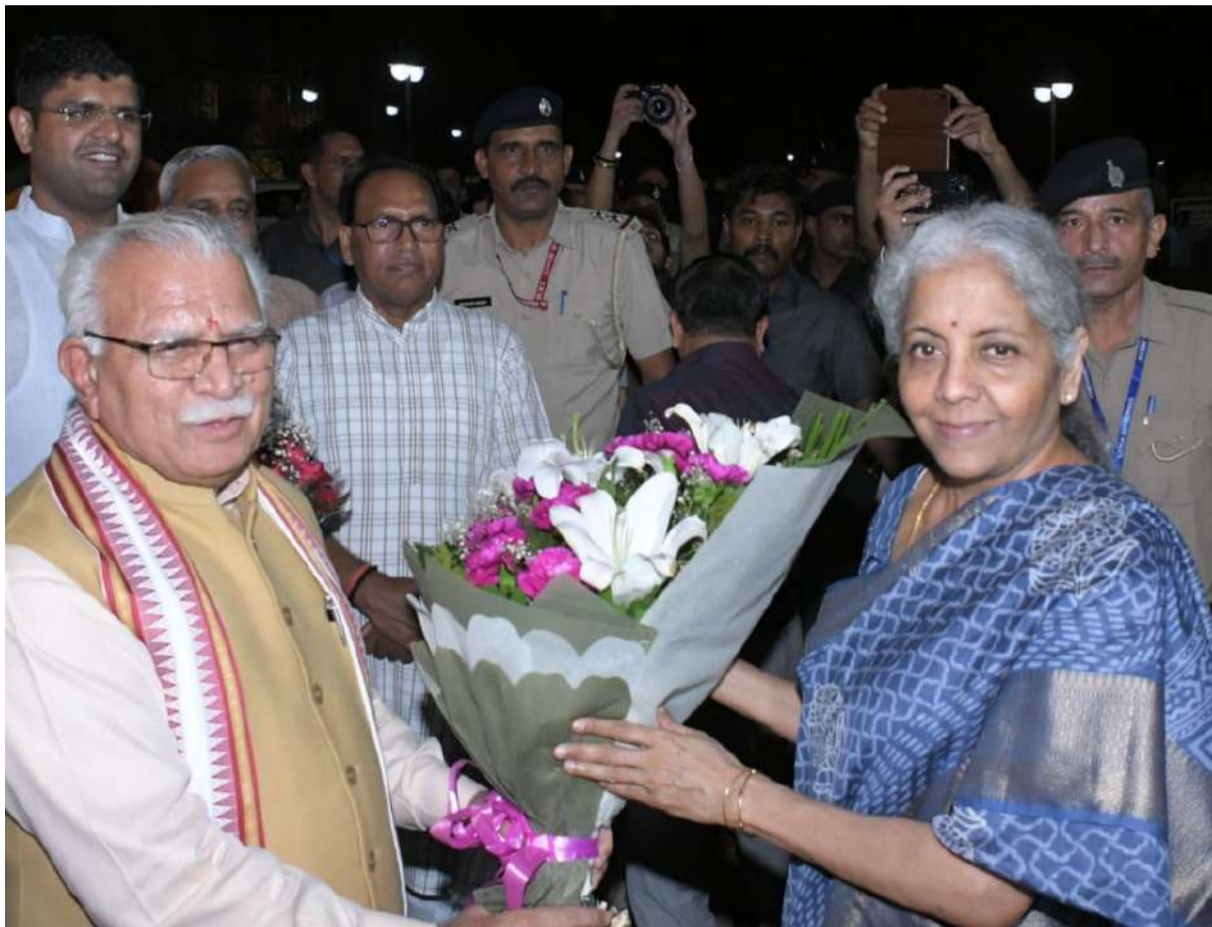
The Union Finance Minister, Mrs Nirjala Sitharaman, being greeted by the Chief Minister, Mr Manohar Lal, at the GST Council's 47th meeting in Chandigarh.