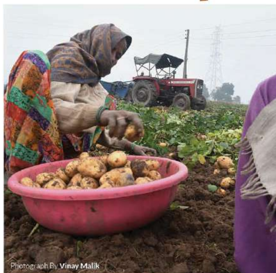
Photograph By Vinay Malik

The state government aims to set up more than 1000 FPOs. Some of these FPOs associated with tomato