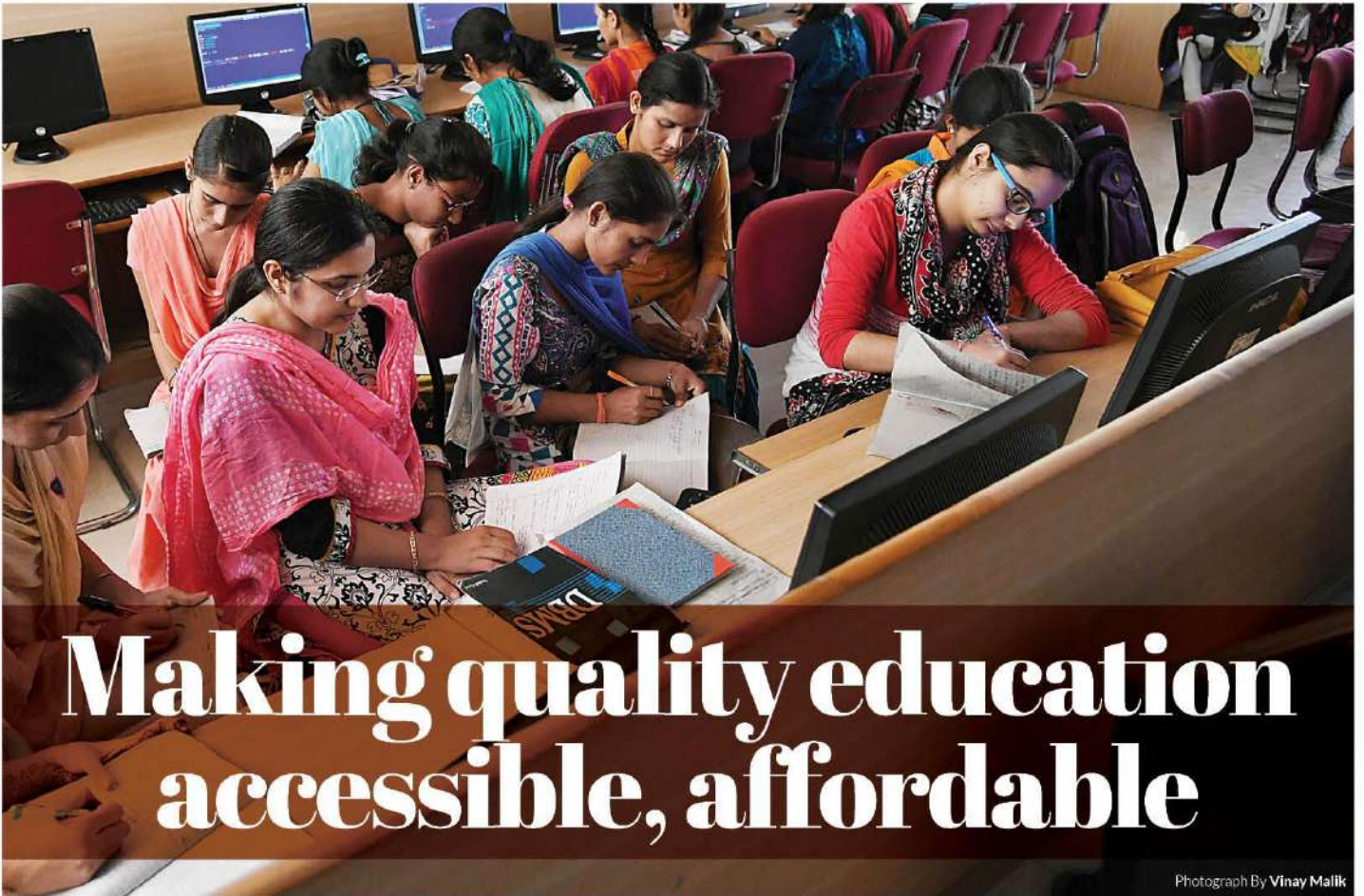
Photograph By Vinay Malik