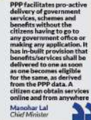
Manohar Lal Khattar, Chief Minister of Haryana, is seen during a meeting.

Making living easy for the man in the street and delivery of citizen-centric services and benefits without the citizens having to go to any government office or making any application, it has in-built provision that benefits/services shall be delivered to one as soon as one becomes eligible for the same, as derived from the PPP data. A citizen can obtain services online and from anywhere. Manohar Lal Chief Minister