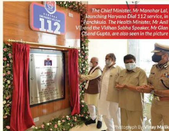
The Chief Minister, Mr Manohar Lal, launching Haryana Dial 112 service, in Panchkula. The Health Minister, Mr Anil Vij, and the Vidhan Sabha Speaker, Mr Gian Chand Gupta, are also seen in the picture

suring the safety of every citizen is the utmost priority of the state government and taking the state government's mantra of 5S — Shiksha, Swasthya, Suraksha, Swablman and Swavlambhan – forward, Dial 112 - Emergency Response Support System (ERSS) has been launched.