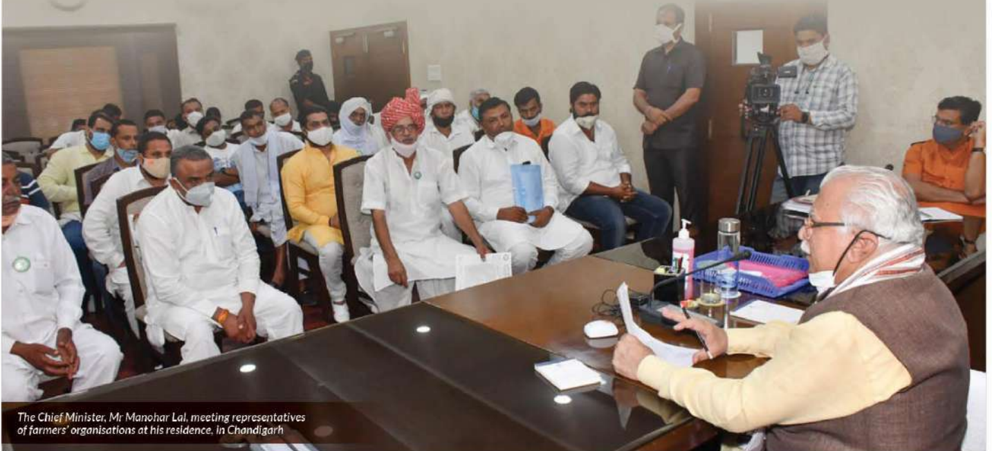
The Chief Minister, Mr Manohar Lal, meeting representatives of farmers' organisations at his residence, in Chandigarh

Keeping this in mind, the 'Meri Fasal Mera Byora' scheme has been implemented to update the data of crops sown on every acre. Similarly, 'Mera Pani Meri Virasat' is being implemented with a focus on proper management of water, said the chief minister.