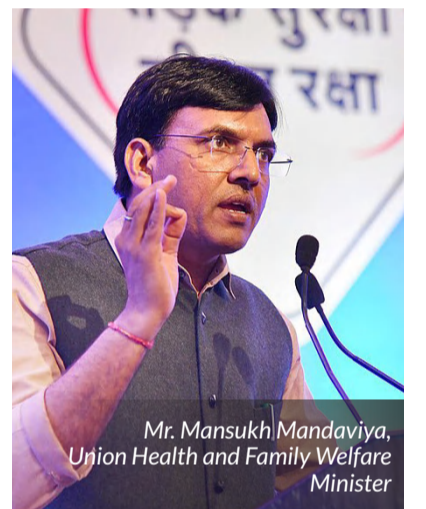
Mr. Mansukh Mandaviya, Union Health and Family Welfare Minister

For the successful efforts made to contain the spread of corona in Haryana, the Union Health and Family Welfare Minister, Mr. Mansukh Mandaviya, has appreciated the Manohar Lal Government, especially the Health Minister, Mr Anil Vij.