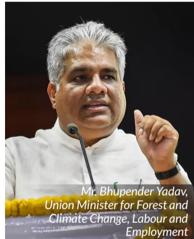
Mr. Bhupender Yadav, Union Minister for Forest and Climate Change, Labour and Employment

In a letter written to Chief Minister, Mr Manohar Lal, Mr Yadav lauded the efforts made by the state government because of