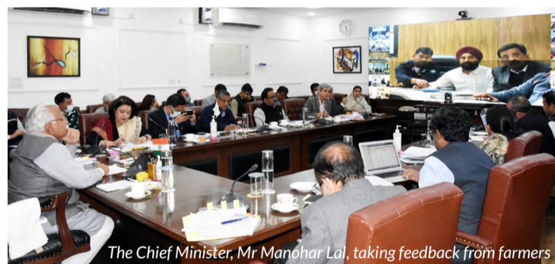
The Chief Minister, Mr Manohar Lal, taking feedback from farmers

This is not to suggest that other segments of economy are not close to his heart. The state government is committed to ensuring welfare of all sectors. Focus will be on industry, especially MSMEs, job creation, health, education, and social welfare. Whatever is good for the people will be done in the Budget, the Chief Minister avers.