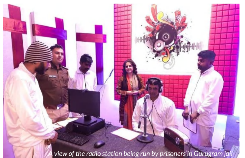
view of the radio station being run by prisoners in Gurugram jail