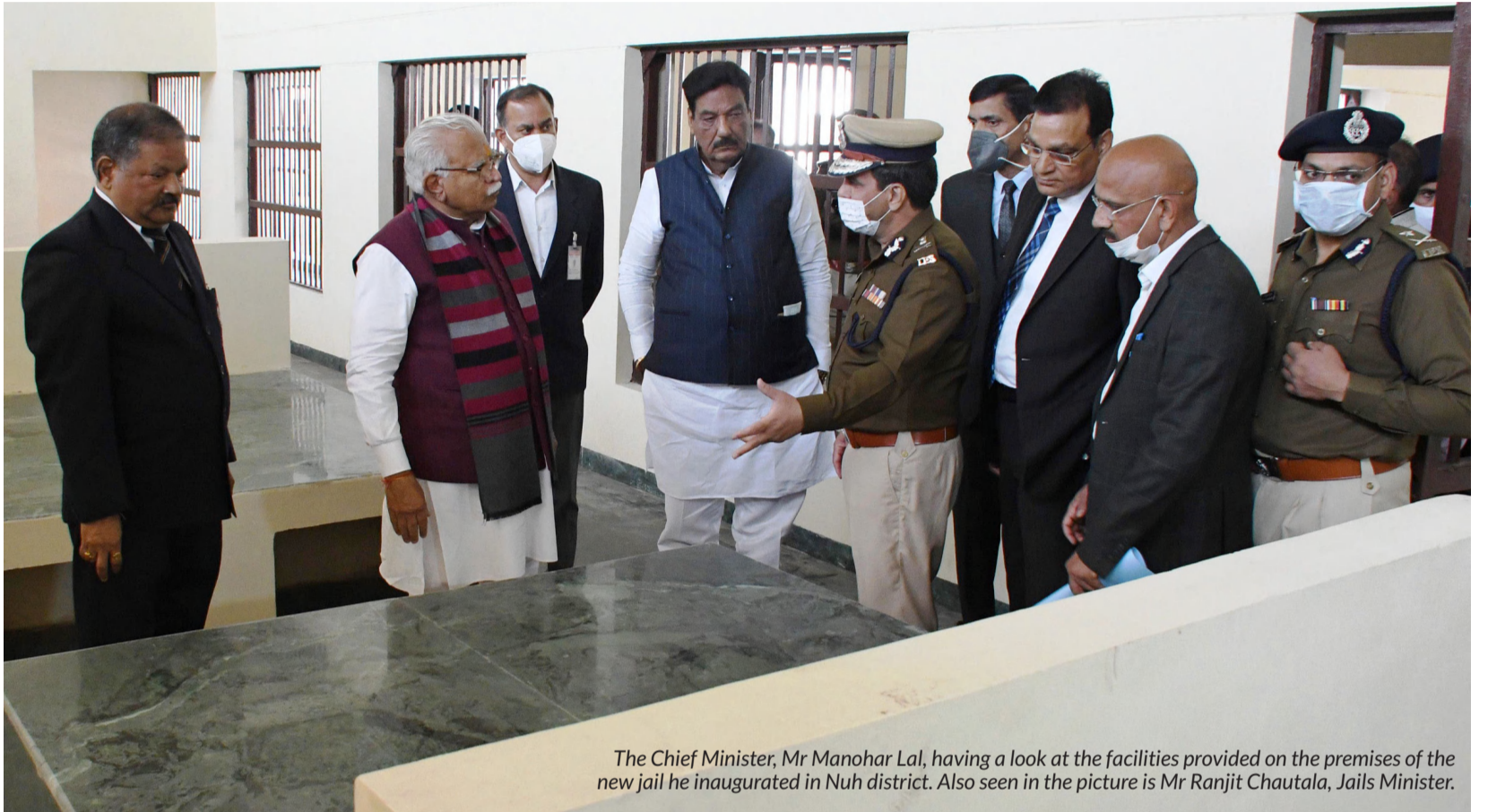
The Chief Minister, Mr Manohar Lal, having a look at the facilities provided on the premises of the new jail he inaugurated in Nuh district. Also seen in the picture is Mr Ranjit Chautala, Jails Minister.

The setting up 'Jail Radio' at Gurugram's Bhondsi jail has been a major step towards bringing a positive transformation in the prisoners and also jails, and it is a unique initiative taken by the