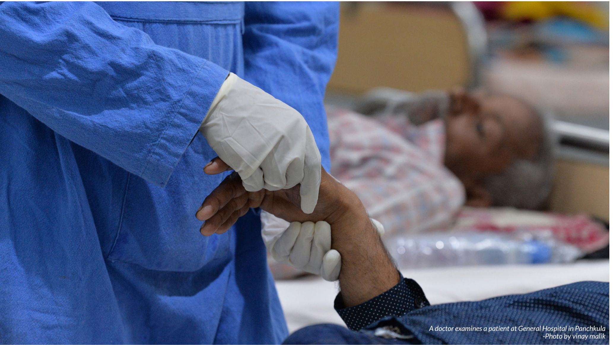
A doctor examines a patient at General Hospital in Panchkula